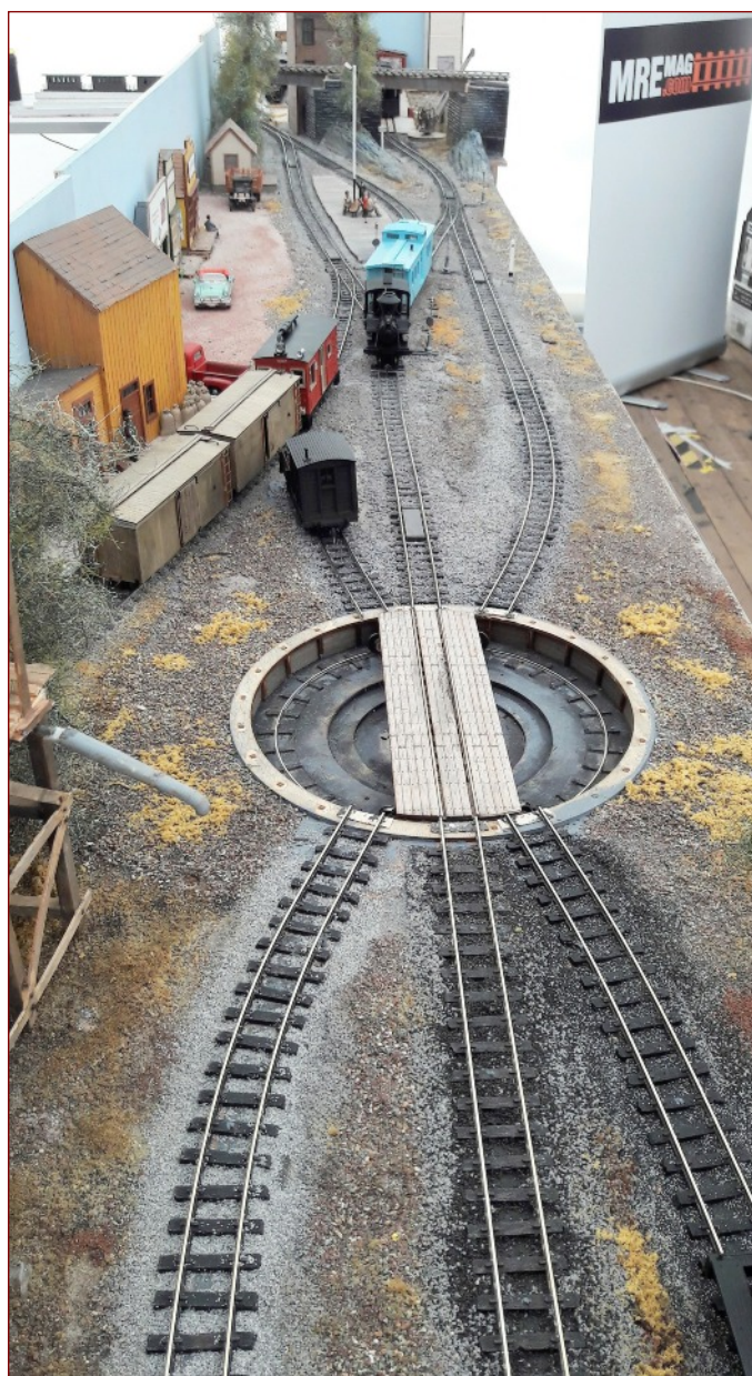
A view looking along the layout.

For me the name 'Snowy River' goes back to the 1982 Australian drama film based on the Banjo Paterson poem 'The Man from Snowy River'. I always thought, 'What a great name for a place!' and have kept it my memory for the right 'model railroad layout'. As an ex-Fitter on the South African Railways, narrow gauge was in my blood. I started as an apprentice in the final years of steam in the Cape changing over to electrical traction in 1983. I came across Bachmann On30 and thought, 'I like this.' It gave the option of ready to run, kit bashing and scratch building in a scale and gauge I could get my head around.